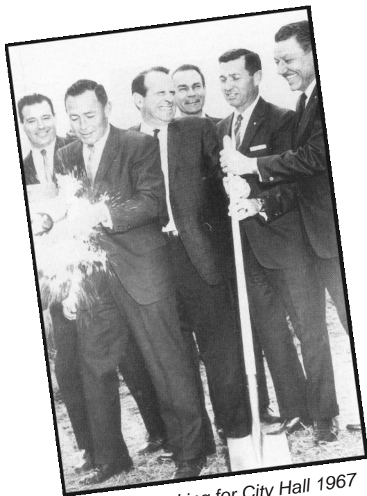
Groundbreaking for City Hall 1967